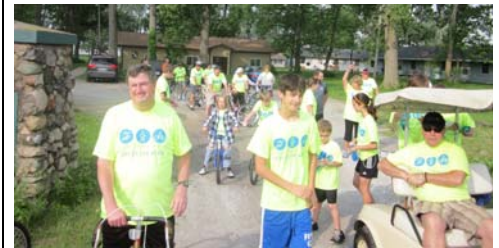
Participants waiting for the starting horn.

Along with the shirts, participants received a water bottle, breakfast and the satisfaction of knowing that they conquered the 4 plus miles. Thank you to all of our volunteers and to the Bremen Conservation Club for the use of their building!